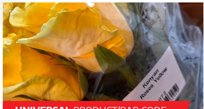
UNIVERSAL PRODUCT/BAR CODE