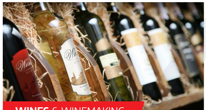
WINES & WINEMAKING